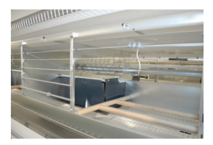
Figure 2. The furnished cage for groups of 10 layers with the nest box located in the rear of the cage. The litter facility is positioned on top of the nest. During the daily period of access to the litter facility the wire gate was turned up against the roof of the cage. No egg belts were present when conducting the trials. Color version available in the online PDF.

In all cages, nest bottoms were lined with artificial turf and all cages fulfilled the requirement of 15 cm of perch length per housed hen. All cages had hard wooden perches. In T8 the nest was enclosed in the front by plastic black curtains, hanging behind the bars of the front gates of the cage. This curtain, ending 1 cm above the cage floor, acted as an egg saving device by reducing the speed of eggs rolling out of the nest into the cradle (Wall and Tauson, 2002). The T10, T20, and T40 cages had egg saver wires (i.e., a wire extending parallel to and underneath the feed trough that stopped eggs on the way out of the cage). The wire lifted every 10 min during the first 6 h after lights were turned on and thereafter twice per hour, allowing eggs to slowly roll the last short distance to the egg cradle.