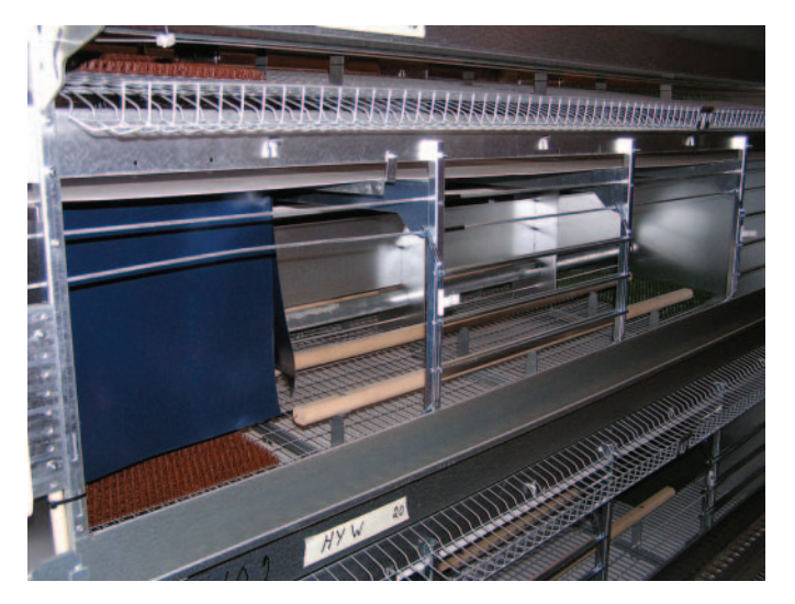
Figure 3. The cage for 20 layers (T20), with the nest to the left behind the plastic curtains and the litter scratch pad (piece of artificial turf) located to the right. A cage for 40 layers (T40) was constructed by making 2 T20 cages into a single T40 either by removing the metal rear partition in the perch area or by providing the rear partition with pop holes. Color version available in the online PDF.