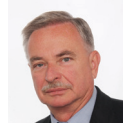
Rapporteur Grzegorz Dybowski

Population: 38.3 million Land area: 31.2 million hectares Agricultural land: 14.6 million hectares Arable land: 10.8 million hectares